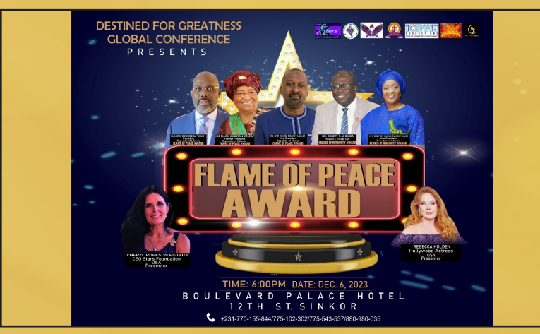
Destined for Greatness Global Conference, Monrovia, Liberia