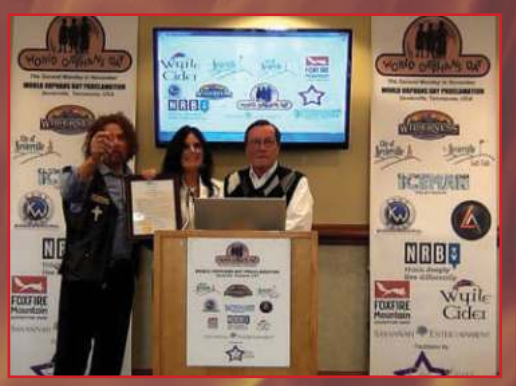
World Orphans Day, Sevierville, TN

Episode content is spawned from distinguished public figures through strong testimonials who share how they are using 'Love in Action' deeds to bring about solutions to the plights associated with the displaced and oppressed children of the world.