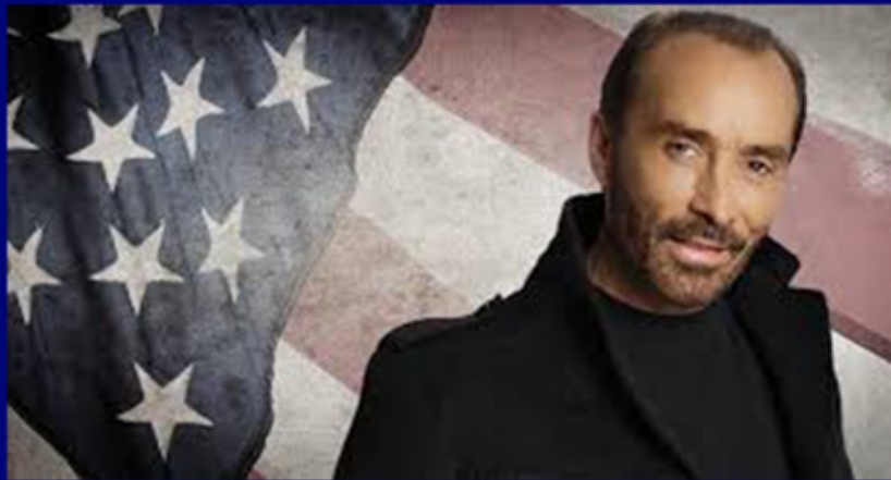
Lee Greenwood Performed God Bless the USA at our Veterans Festival

National Pre-Promotional Campaigns Include: Dolly Parton World Orphans Day Theme Song – Music Video Shoot World Orphans Day International Radio Simulcast Flame of Peace International Concert Tour "See separate attachments for each Campaign"