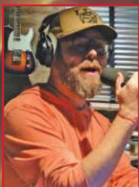
Todd Tilghman The Voice Winner, 2020