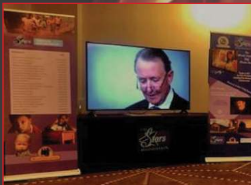
Lord David Alton, UK Parliament-Life Peer

Episode content is spawned from distinguished public figures through strong testimonials who share how they are using 'Love in Action' deeds to bring about solutions to the plights associated with the displaced and oppressed children of the world.