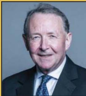
Lord David Alton

Heroes of Humanity People with Hearts on Fire to make a Difference in the World