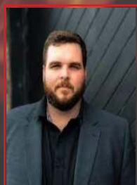
Jake Hoot The Voice Winner