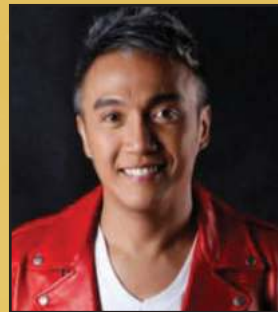
Arnel Pineda, Journey