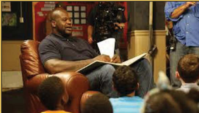
Shaquille O'Neal, Foster Boy movie