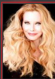
Rebecca Holden Hollywood Actress

HEARTS on Fire™ is a fast moving one-hour television show that empowers the armchair viewer to "Take Action". The series is an amalgamation of "Love in Action" deeds while showcasing a strong message of Peace, Love and Change for the deprived children of the world. HEARTS on Fire™ has been cleared for broadcast in the USA by the NRBT Network reaching 50 million households weekly. International syndication commences upon completion of the USA broadcast schedule.