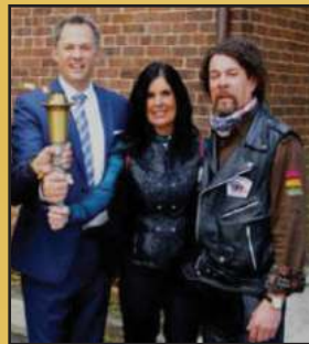
Lt. Gov Dan Forest, NC