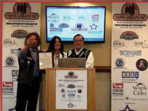
World Orphans Day, Sevierville, TN

Episode content is spawned from distinguished public figures through strong testimonials who share how they are using 'Love in Action' deeds to bring about solutions to the plights associated with the displaced and oppressed children of the world.